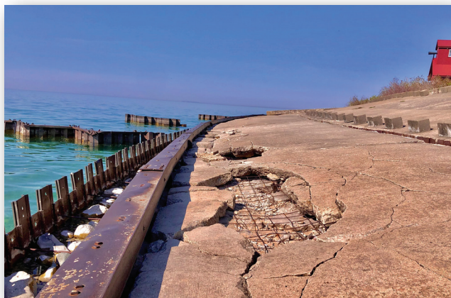
Lower water levels increase the visibility of the damage

Over the course of the winter the water level in Lake Michigan has thankfully receded by ten inches or so. While that is a helpful and wonderful short-term blessing, it cannot responsibly be assumed to be permanent, or even a harbinger of more to come. So, our efforts to address the SPS repairs remain in urgent mode.