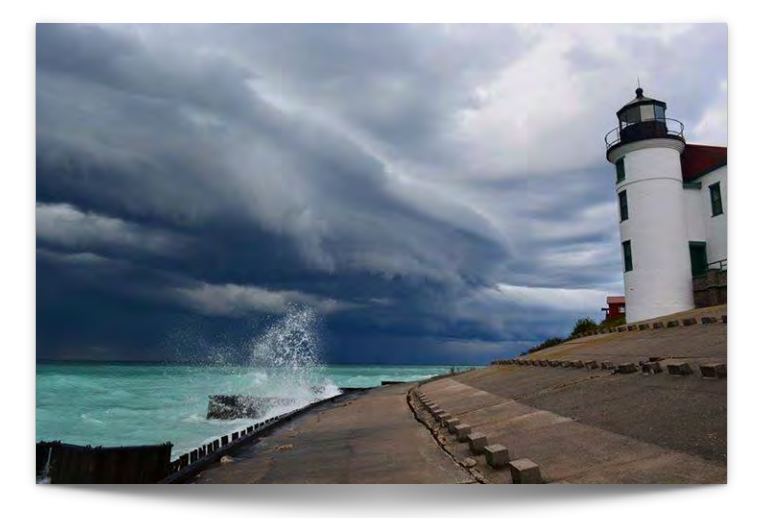
The Shoreline Protection System extends from the Lighthouse into the waters of Lake Michigan.

The $1 million-plus campaign will fund two much-needed projects, says Board President Dick Taylor: repairs to the crumbling Shoreline Protection System, which prevents erosion in front of the Lighthouse; and safety and access improvements to a widened Point Betsie Road end.