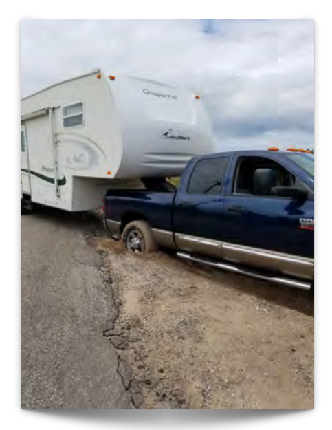
Taken in Summer of 2018 ... unfortunately a common scene at Point Betsie.

The "road end" project has been under development since 2003. A joint committee of the Friends, Benzie