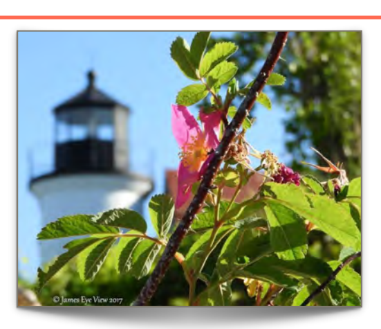
James Eye View Photography