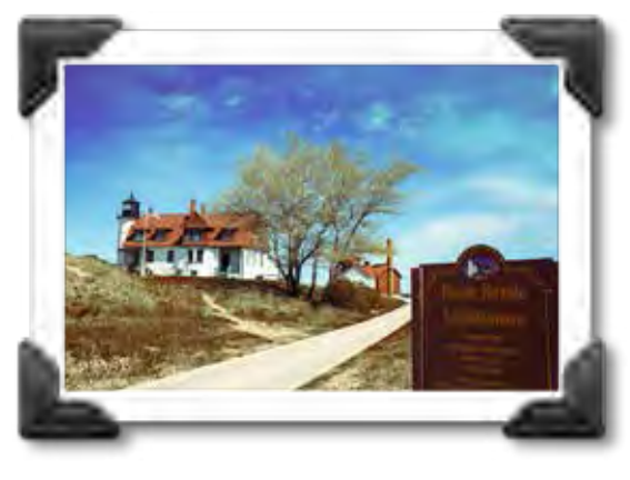
Point Betsie Lighthouse Heather Bunkelman