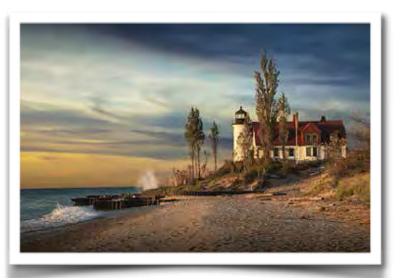
3rd Place Winner Point Betsie at Sunset Randall Nyhof