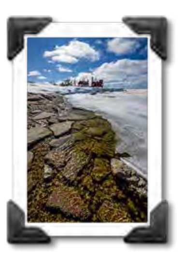
Transition Todd Reed