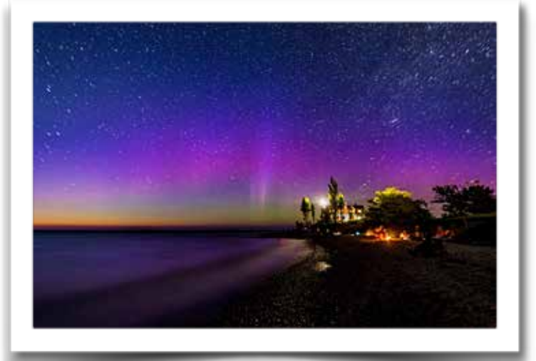
2nd Place Winner Aurora at Point Betsie Brad Reed