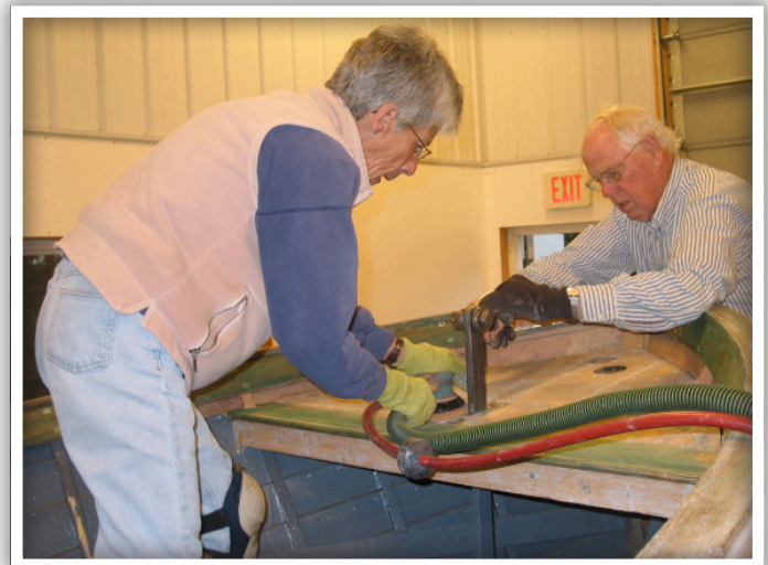
Photo By Andrea Frost, "foreman" of the lighthouse tender restoration crew.