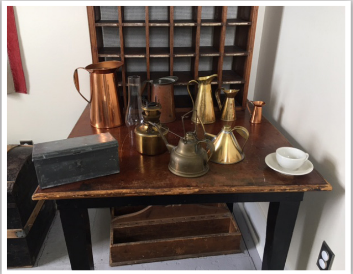
New acquisitions are on display near the Fresnel lens.