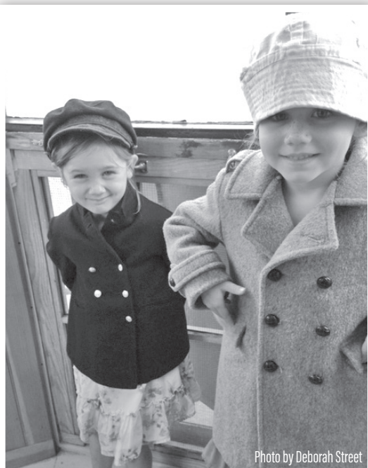
Young visitors in nautical garb enjoyed visiting the tower in June.