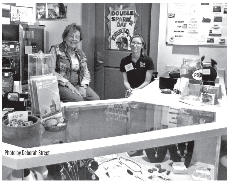
The Gift Shop provided many treasures and mementos for sale.