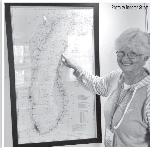
Docents like to use the map of Lake Michigan for visitors unfamiliar with the area.